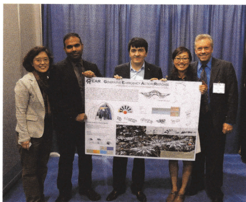
Iowa State University students, faculty advisor and host.

The charette program began with a kick-off event and dinner hosted in the offices of Gensler. Each team, then, launched into design work on Sunday in the offices of their host firms. Sunday evening included a dinner and networking event. On Monday morning, the students were back in their