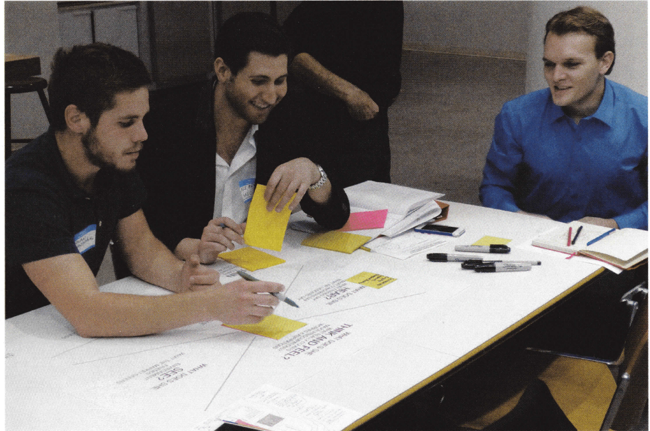
The student design charette team from the Art Institute of Chicago begins collaborative design at the Saturday kick-off event.

Today, the CARITAS Project conducts various educational initiatives to bring research findings into mainstream practice. One of these initiatives, Generative Space Week ( generativespaceweek.net ), includes a range of programs that enable individuals to learn about generative space and to