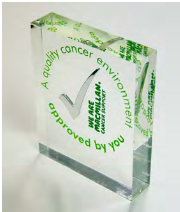
Macmillan Quality Environment Mark