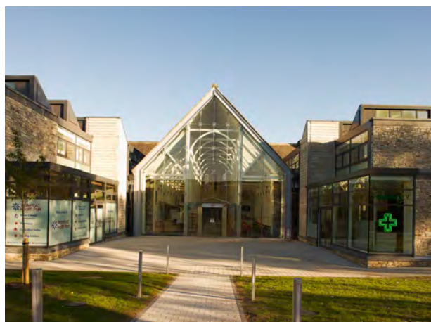
Waterford Health Park, Waterford, Ireland. Original structure dates back to a mid-19th Century convent designed by A.W.N. Pugin. 2009 additions and renovations by dhbArchitects. http://dhbarchitects.ie/

Action research is one specific methodological approach to conducting research within the field of healthcare facility design that is well suited for this application. It is a methodology predicated on application, rather than theory, and its findings can be quantitative or qualitative, or both. More significantly, this methodology is readily learned and easily applied to healthcare design, providing an approach that can be generalized, therefore increasing the potential for the findings to be credible, valid, and reliable.