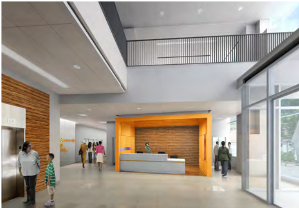
Community of Hope, Washington, DC. Reception and Community Education Center

In healthcare today, where almost all organizations are challenged to provide better outcomes with reduced resources, action research can contribute tremendous value. As noted by the variety and depth in the current projects, the concept is not complex, resource intensive, time consuming, or in any way limiting but rather is heralding the introduction of a new paradigm in how professional design services can provide revitalized leadership and increased value for clients.