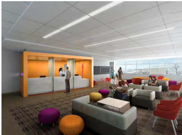
Community of Hope, Washington, DC. Primary, Behavioral and Dental Clinics reception